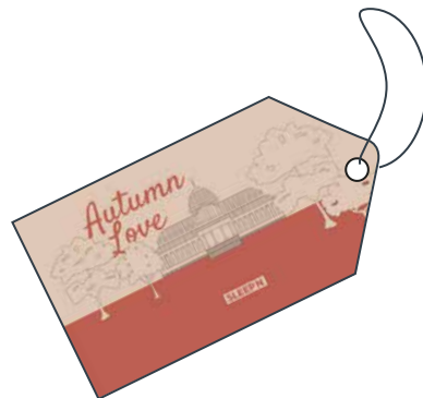
- PART B